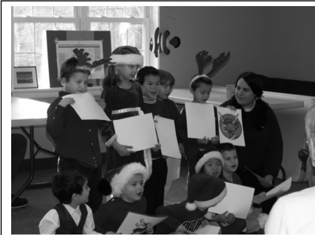
An area kindergarten class came to visit us the week Holidays.

The clients went shopping for the Holidays at the Bon Homie Country Store. The clients for the last several months have had the opportunity to earn points for which they could then use to purchase items from the country store. The clients earned points by participating in the program every day. They also earn points by doing well in various activities. For example - bowling, golfing, word games.