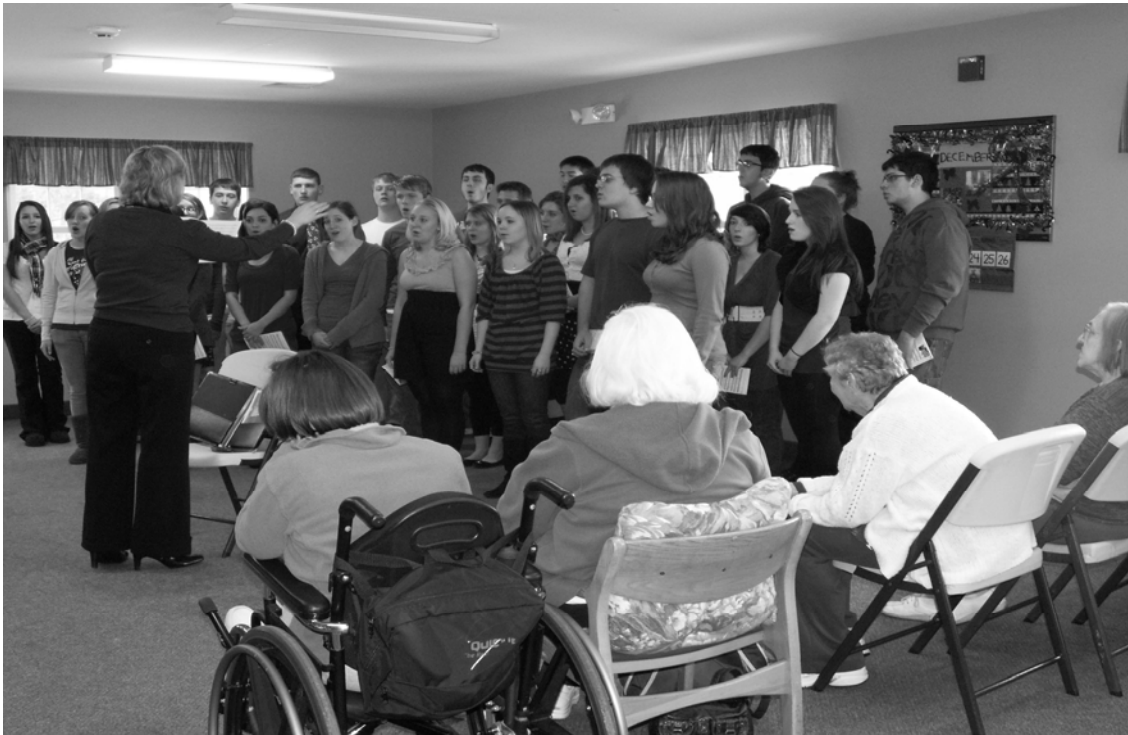
The Spring Ford Choral Group from Spring Ford High School stopped in at Bon Homie for the Christmas Holidays. They are such a talented group, we all enjoyed listening to their renditions of all our favorite holiday carols.